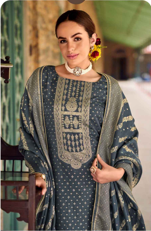
Inspired by history, designed for now. A modern silhouette with an ethnic vow. Fabrics that flow like a river's song. In every dress, the roots stay strong.